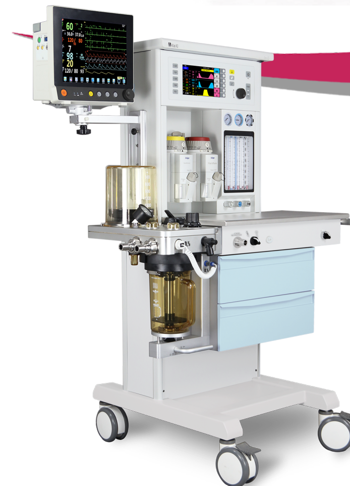
Atlas N3 Vet Anesthesia Machine